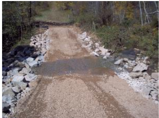
Rock Ford Crossing